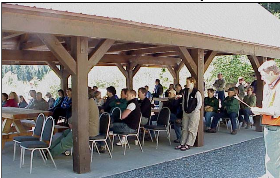
The dedication ceremony was held under one of the new picnic shelters

A number of informational signs are posted at several kiosks in the campground, with information on the geology, history, and biological diversity of the surrounding area. A couple of short barrier-free loop trails head out from the campground, to provide easy nature hikes for families with small kids.