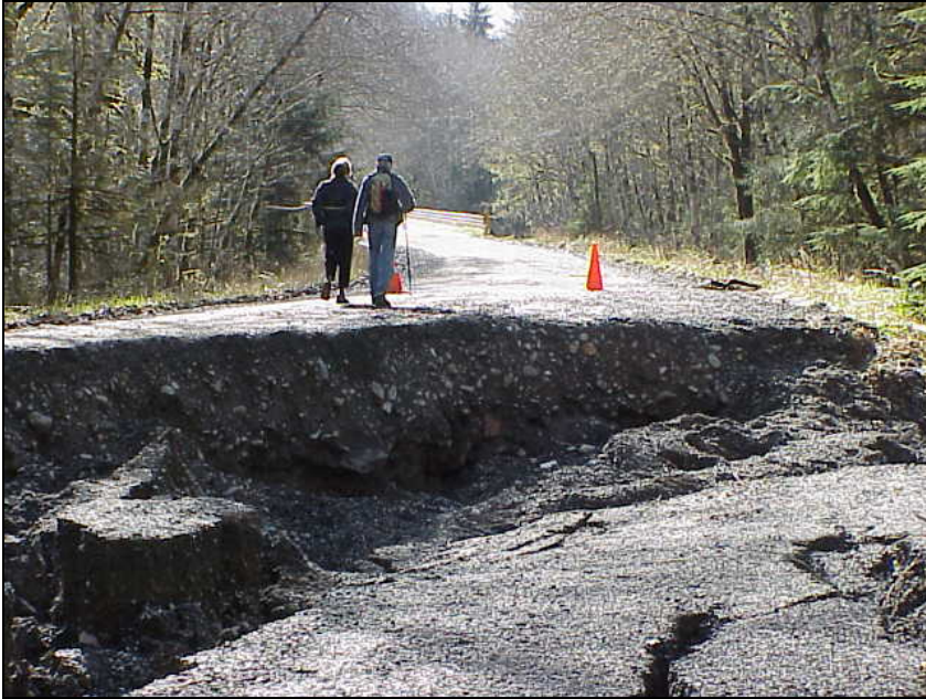
The washout in February: the concrete bridge is visible in the background.

that is located about 5 miles in along the Middle Fork Road.